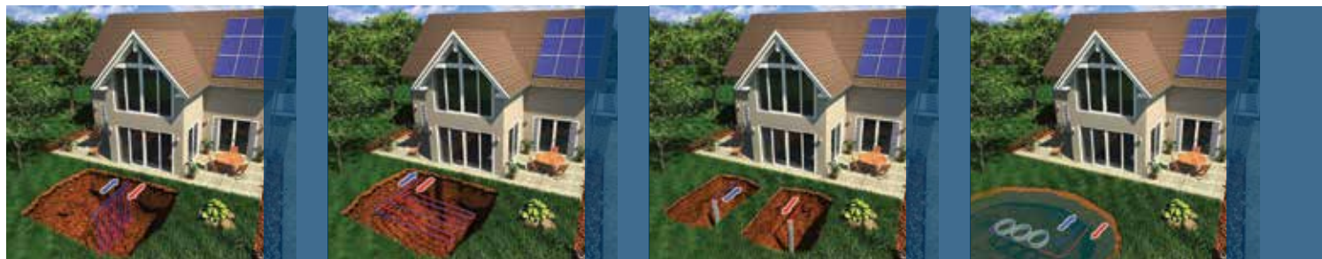
Vertical Ground Loop System